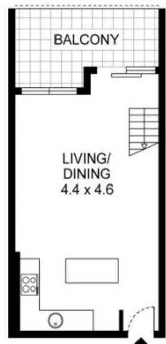
LEVEL FOUR APARTMENT