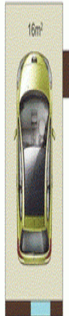
SECURE, UNDERCOVER CAR SPACE